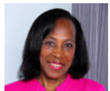
Dr. Madeline Manning Mims '11-M.Div., '16-D.Min.