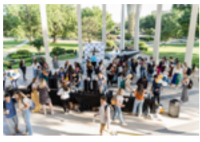
Enrollment is up!