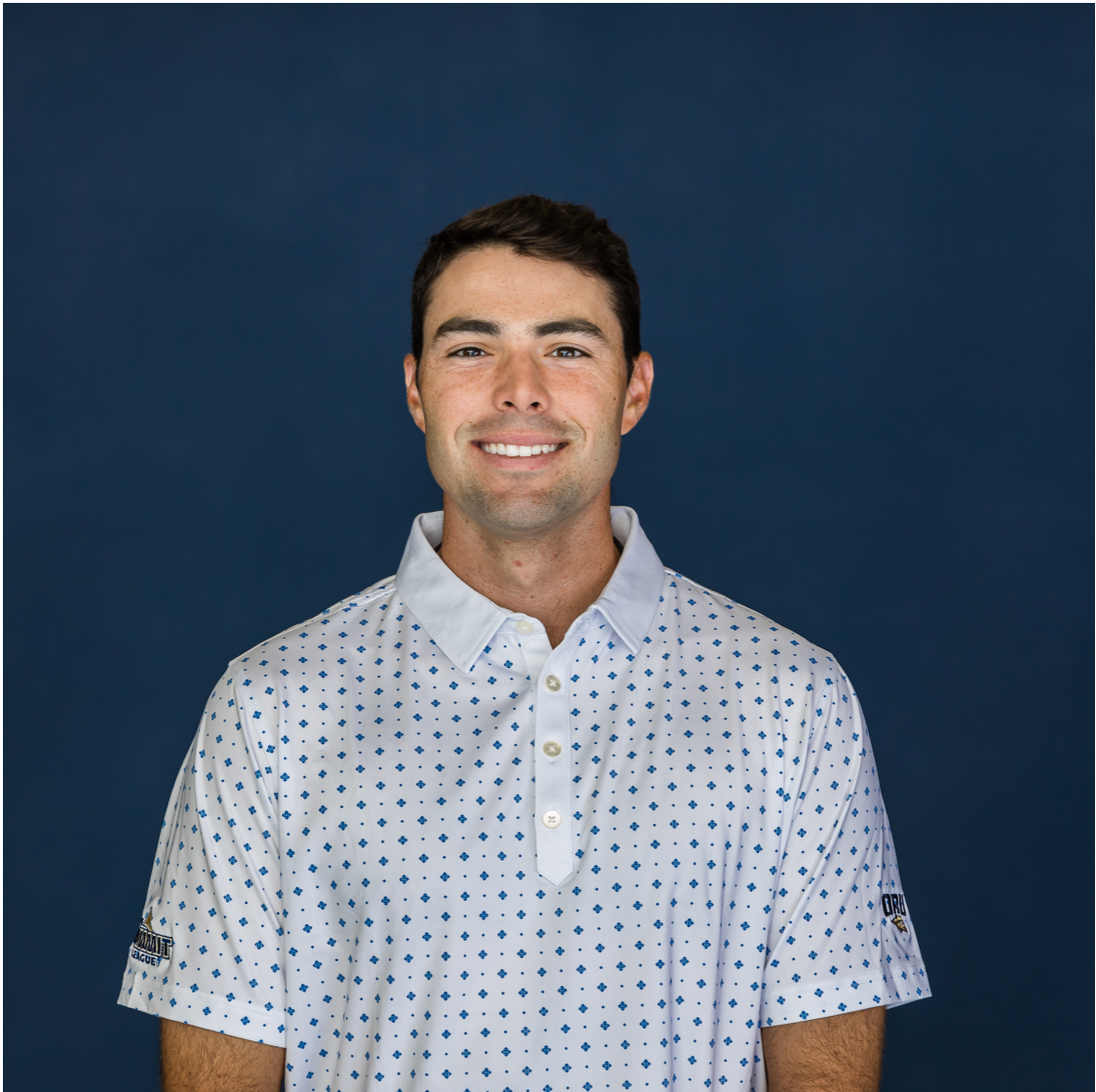
TOPS IN GOLF