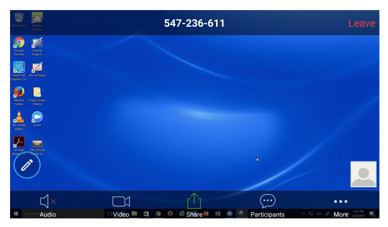
This is how Zoom looks on a smartphone when a teacher shares his/her screen with students.